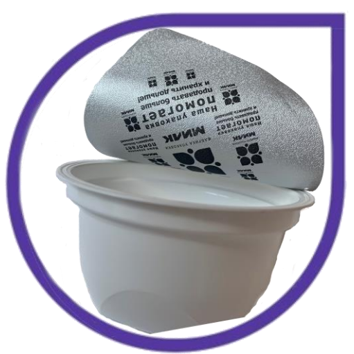
Information on the back side of the die cut lid