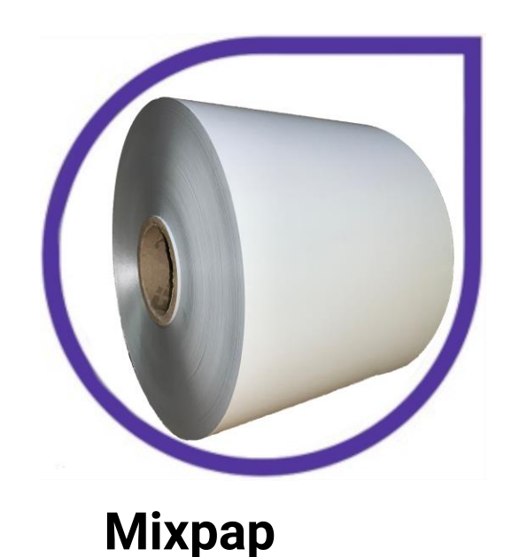
chipper then foil